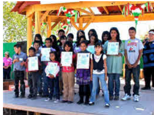
Children who received certificates

We learned that school is not free for these children living in extreme poverty conditions. Public elementary students are not admitted unless they provide their own school supplies and uniform. Secondary students must